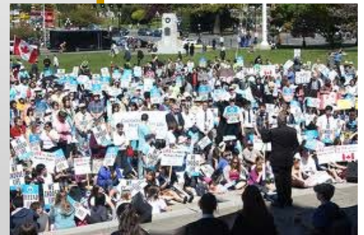
March for Life rally in Victoria, BC